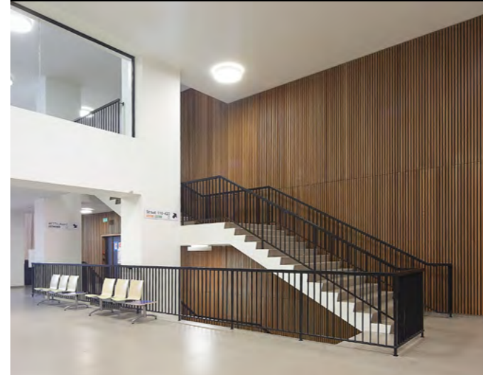
AZ JAN PALFIJN | Hospital Ghent

Our focus lies in sustainability, functionality, aesthetics , and the seamless integration of our products into the specific environment of each healthcare institution. With precision and dedication, we contribute to the enhanced quality of healthcare environments.