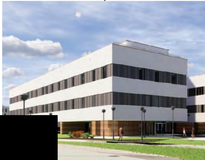
UZ ANTWERP | Hospital Antwerp

“ Together, we ensure an environment where care, comfort, and well-being take center stage.