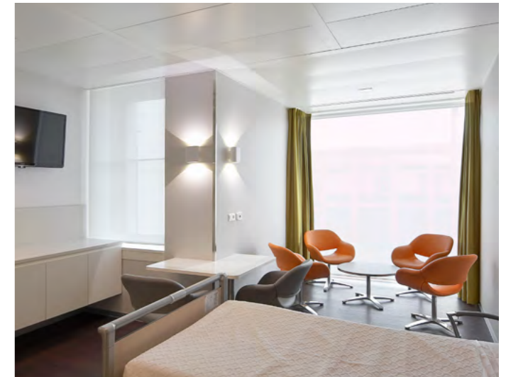
AZ DELTA | Hospitals Rumbeke - Torhout

The JB COOL® climate elements on ceiling tiles replace the classic air conditioner or heater. The plenum is easily accessible.